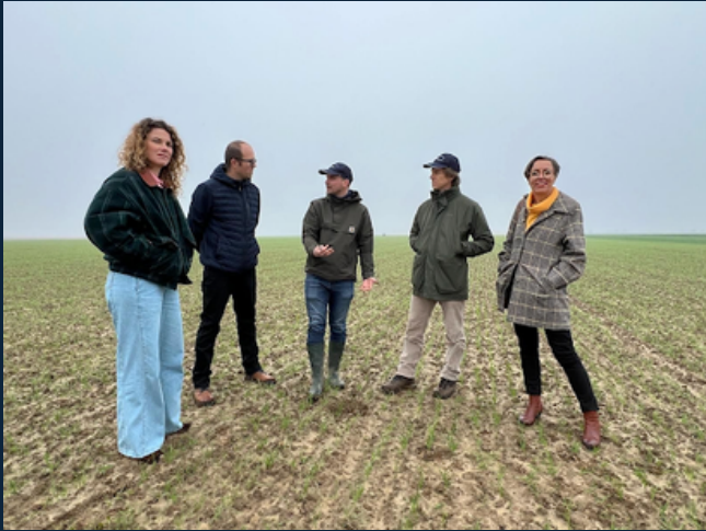
Picture: Cécile Coutens (President of Royal Canin) and Soil Capital during a visit at Teddy Sparrow's farm

In 2023, Royal Canin® partnered with Soil Capital to initiate a five-year project aimed at engaging, training, and financially supporting farmers and farming cooperatives in its supply chain. The collaboration targets up to 300,000 hectares of farmland over a 5 year time long period, focusing on adopting regenerative agriculture practices to improve soil health, water resilience, biodiversity, and climate resilience.