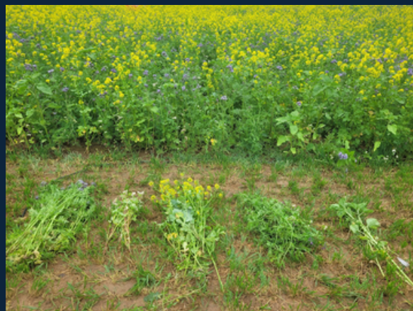
5-species cover - from left to right: phacelia / buckwheat / mustard / vetch / sunflower

Cover crops help maintain and improve the soil structure with their root system. By increasing soil carbon levels and organic matter, cover crops enhance nutrient cycling, gradually releasing nutrients to benefit subsequent cash crops. This practice not only captures more carbon but also helps retain water and prevent erosion.