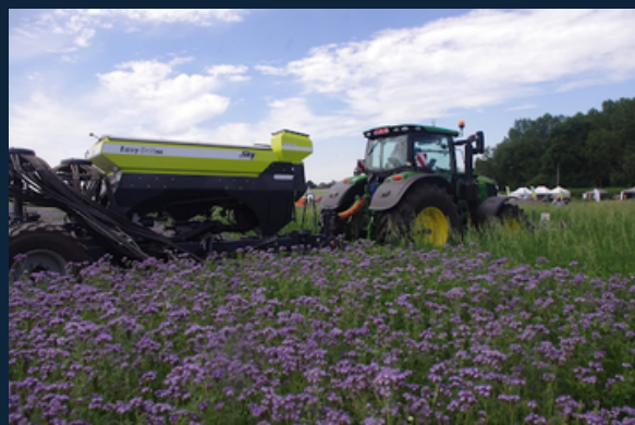
Example of reduced tillage: direct seeding under phacelia cover

Deep tillage can disrupt soil life, reduce stable organic matter, and lead to issues such as erosion and soil compaction. By adopting minimum tillage or no-till methods, farmers minimize soil disturbance, helping store carbon in topsoil layers and promoting soil biodiversity, especially beneficial organisms like earthworms.